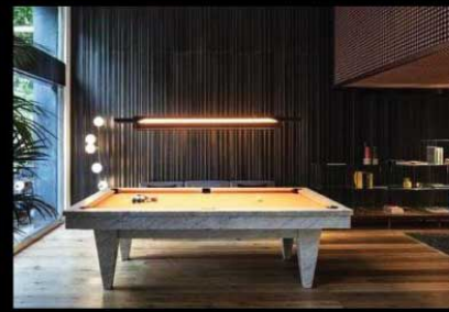
POOL TABLE & LIGHT DESIGN