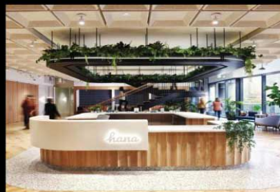
ISLAND BUFFET COUNTER