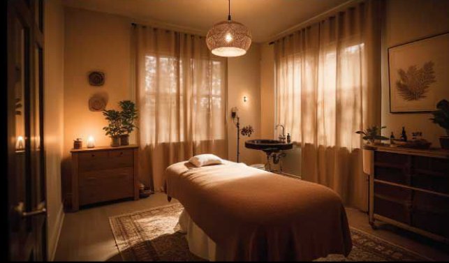
SPA TREATMENT ROOM