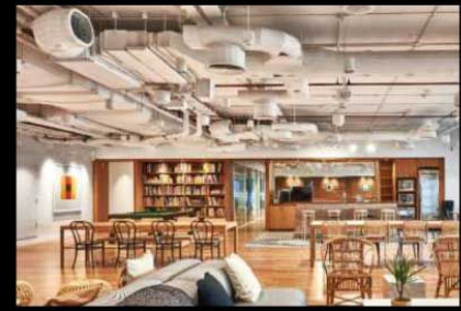
OPEN DUCTING CONCEPT