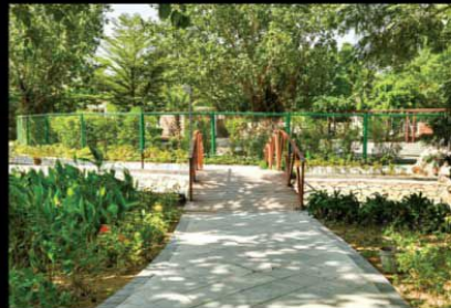
ENTRY FOREST BOARD WALK