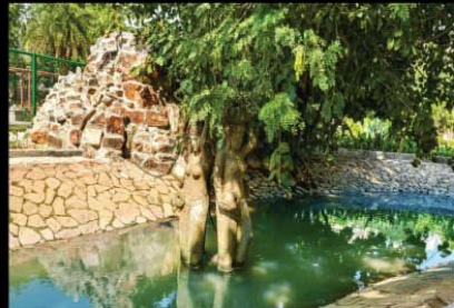
WATER BODY SCULPTURE