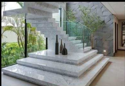
SOCIAL STEPS CONCEPT