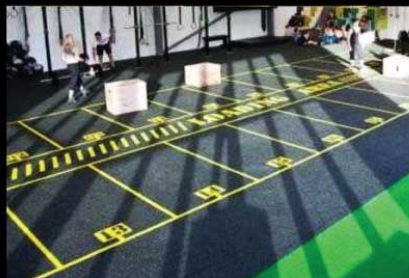
COLOURED FITNESS AREA