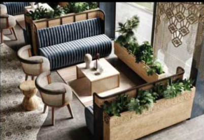
SOFA SEATING DESIGN