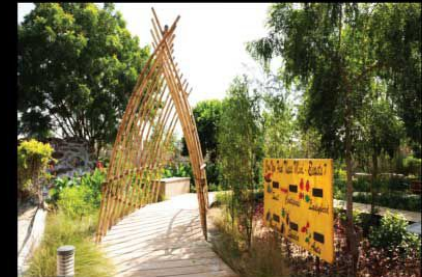
FOREST BOARD WALK