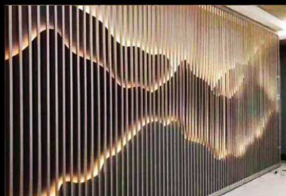
WALL PANNELLING DESIGN