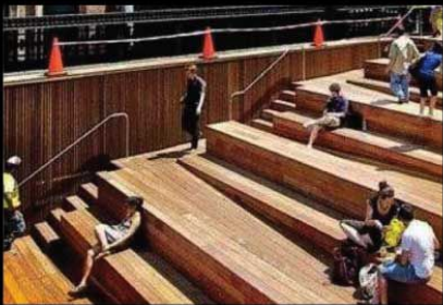
STEPS FINISH IN WOOD