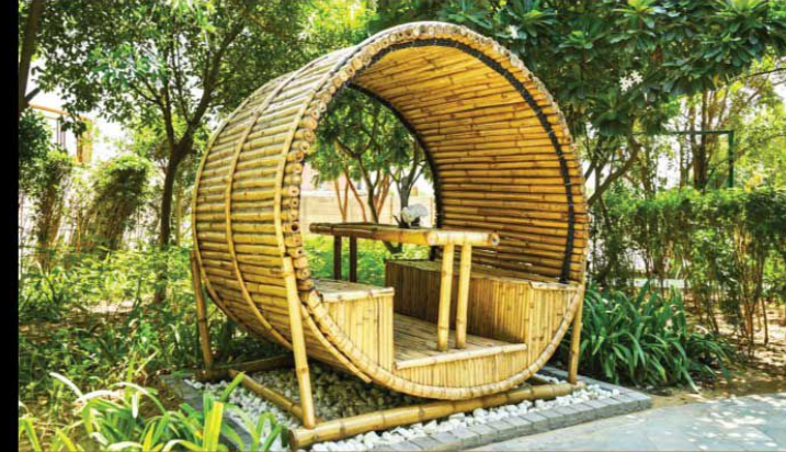
OUTDOOR MEETING KIOSKS