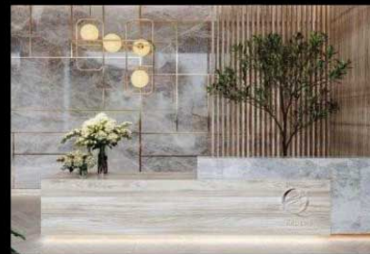
TREES & PLANTERS